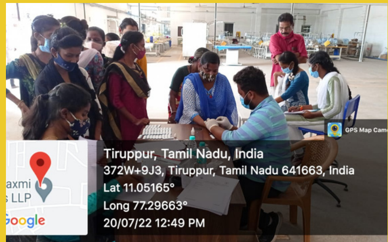
Mega health camp, CBS and STI camp organized at Vaibhav Lakshmi Textiles, Palladam.