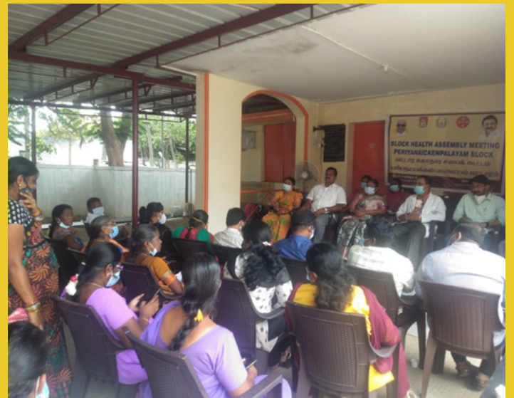
Participated in Block Health Assembly meeting at Periyanaickenpalayam block