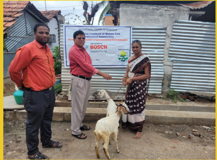
8 Goats were distributed to 4 additional beneficiaries at Annanagar, Athipalayam and Kaalipalayam