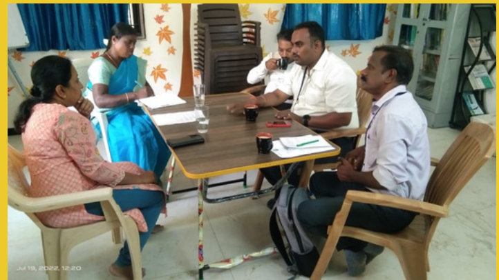
Participated in meeting with Sharatha Company at WWF Office