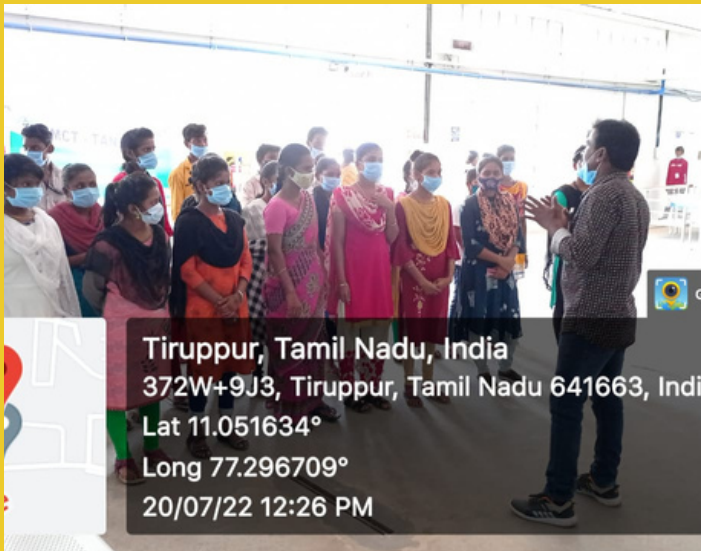
Street play Awareness Program in Vaibhav Lakshmi textiles, Palladam.