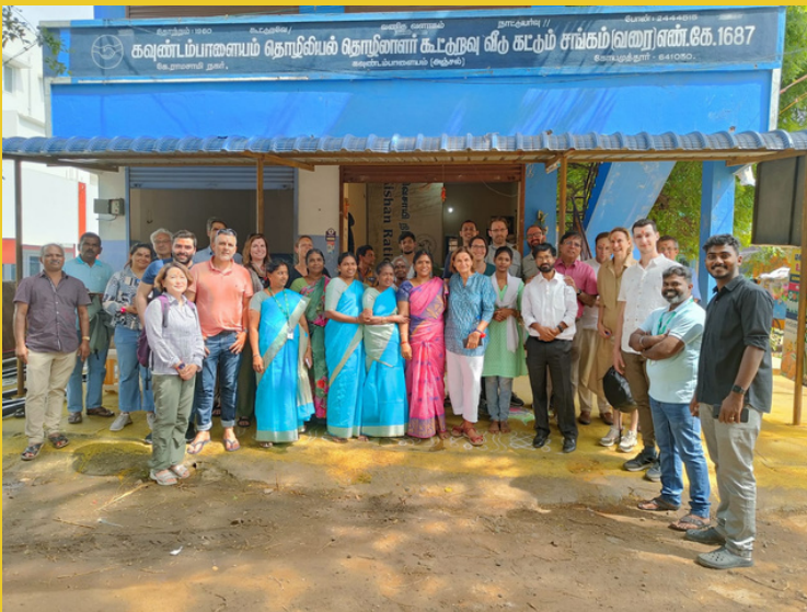
Visitors from KKF with Vimuktha and NMCT staffs