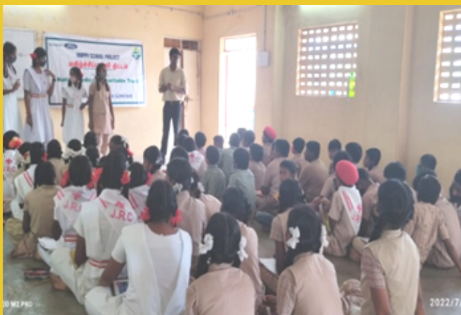
Student Learning Behavior Sessions were conducted in 5 schools by child psychologist.