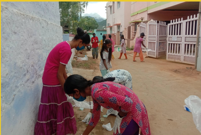
As a part of Swachata Program, children were involved in cleaning the surroundings.