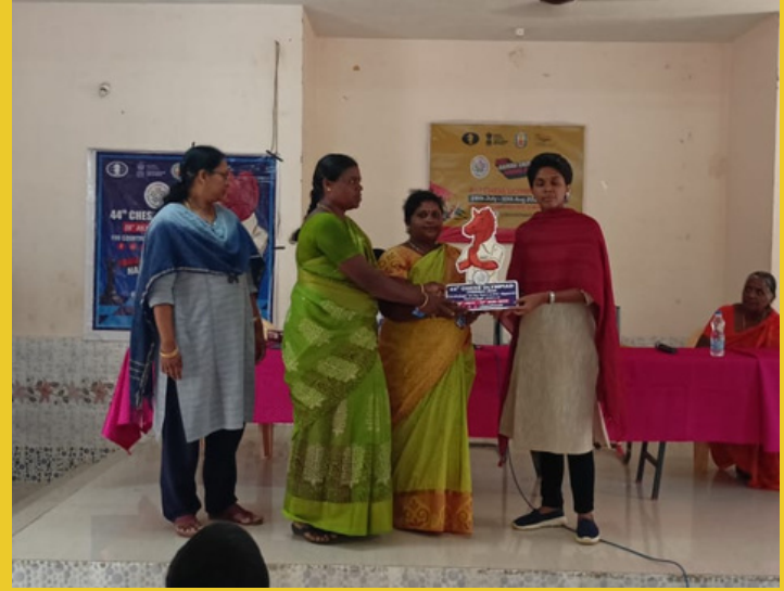
Participated in CFR Meeting in Velliyangadu Panchayat with RDO