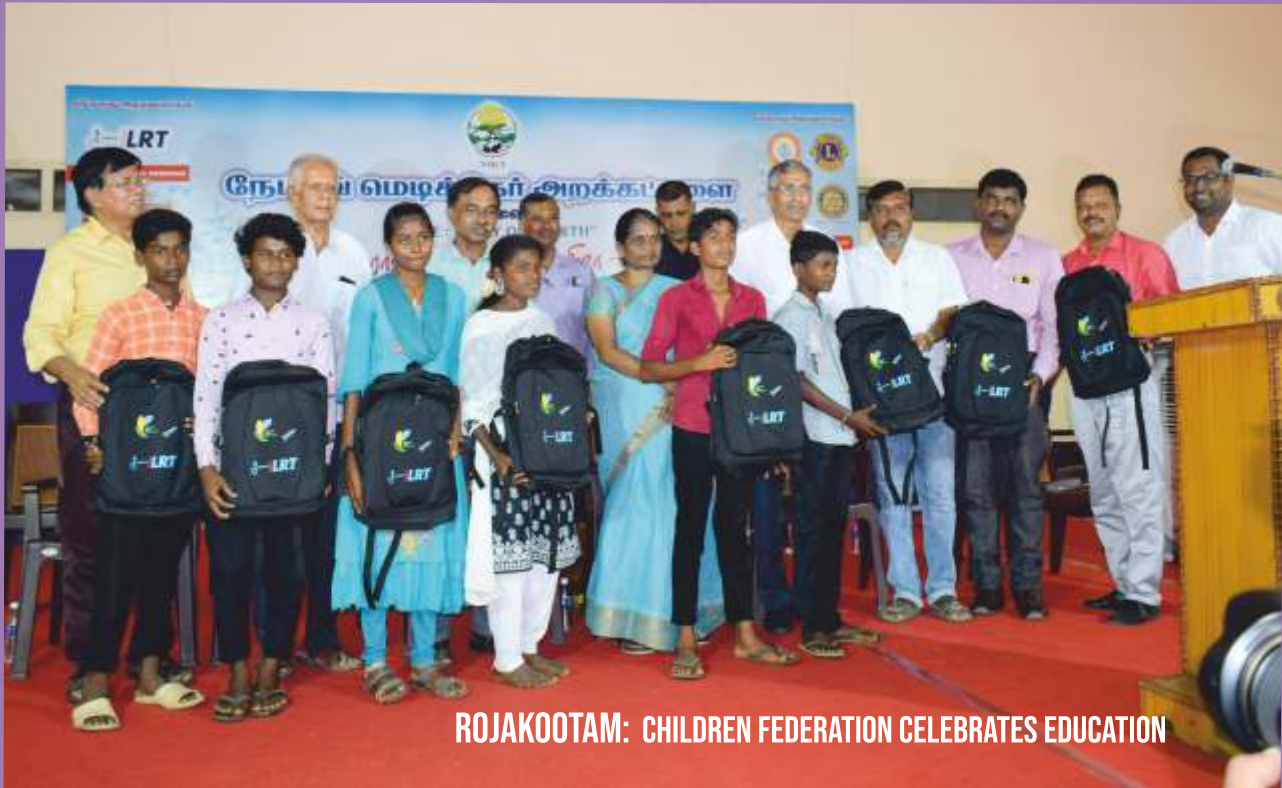
ROJAKOOTAM: CHILDREN FEDERATION CELEBRATES EDUCATION

Rojakootam literally means “Bunch of roses”. Early 2002 to 2005 when a HIV Care and Support Program was implemented in Coimbatore district, we ensured that no affected child in the families of HIV infection should stop going to school. Over 1000 families were reached under the project. Each child from the HIV infected family was motivated to save monthly Rs.20. For each saving child, a local donor was identified who came forward to support Rs.50 per month to that particular child saving regularly. The collected savings of the child and the respective supporter/donor was pooled together every year and child was given this money for the purchase of bags, notebooks etc. This program called as ‘Join Hands’ motivated the children continue going to school without dropping out.