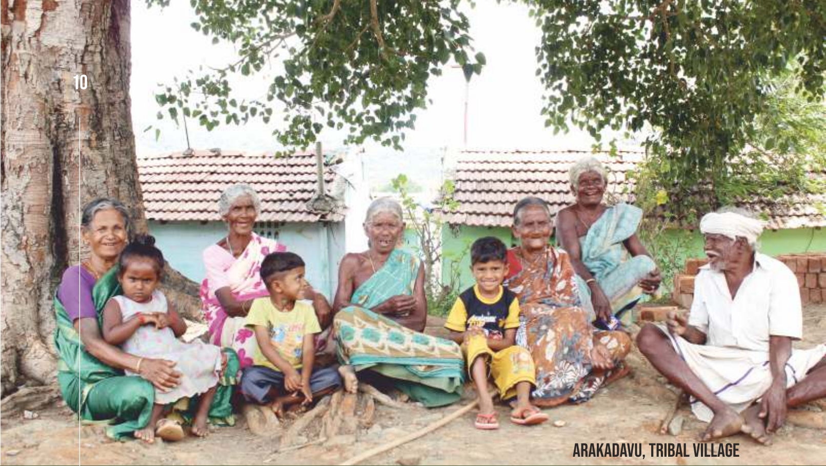
ARAKADAVU, TRIBAL VILLAGE